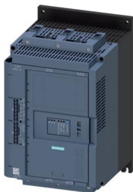
SIRIUS soft starter 200-480 V 77 A, 110-250 V AC spring-type terminals Thermistor input