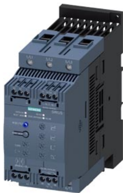
SIRIUS soft starter S3 80 A, 55 kW/500 V, 40 °C 400-600 V AC, 110-230 V AC/DC Screw terminals