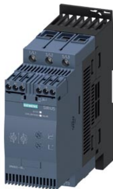
SIRIUS soft starter S2 72 A, 37 kW/400 V, 40 °C 200-480 V AC, 24 V AC/DC Screw terminals