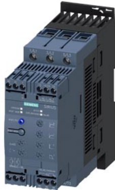
SIRIUS soft starter S2 72 A, 37 kW/400 V, 40 °C 200-480 V AC, 110-230 V AC/DC Screw terminals