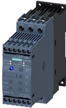
SIRIUS soft starter S0 25 A, 11 kW/400 V, 40 °C 200-480 V AC, 110-230 V AC/DC Screw terminals